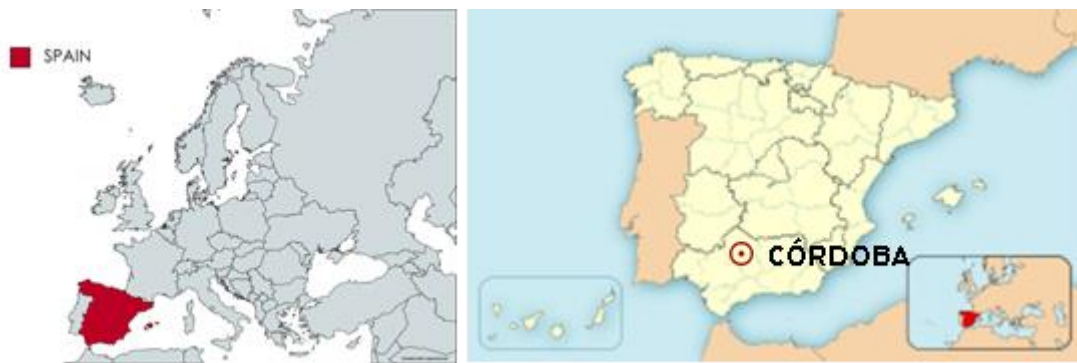
Figure 2. Geographical location of the city of Córdoba.