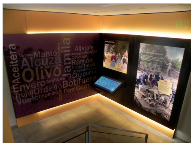
Figure 1. - Museumized area from El Pilar olive oil mill cooperative, Villacarrillo, (Jaén, Spain). Source: own production.

The objective of this research is to study the degree of museumization of olive oil mills in rural areas of Andalusia, according to the definition of a museum proposed by the most progressive sectors of the International Council of Museums (ICOM). Thus, the novelty of this research lies in the fact that no previous study in the literature has addressed the degree of museumization of oil mills. This article thus offers an innovative vision of the conservation of the olive grove landscapes and their rich heritage.