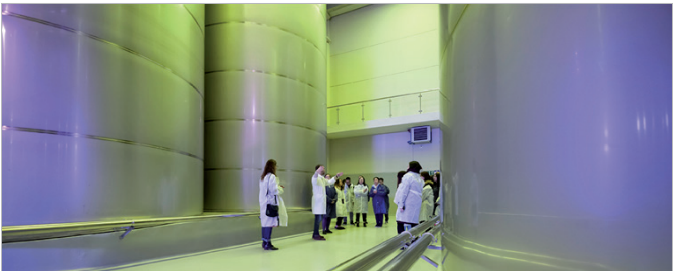
Figure 3.- Interpretative explanation for tourists of the olive oil cellar. Picualia olive oil mill, Bailén (Jaén, Spain).

The corporate museums are physically located in the mills themselves and are managed by the organizations (in this case, companies in the olive oil sector). They are powerful marketing tools (Bonti 2014) capable of transferring the set of knowledge and values held by the companies to the museum's customers and visitors. This transfer of knowledge and values has been called organizational memory (Danilov 1992; Katriel 1994; Nissley & Casey 2002). However, when doing so it is essential to bear in mind the strategic lines of the definition of the museum in order to preserve the olive oil heritage and the organizational memory of these olive oil mills. The virtualization of these spaces have evolved to become museums designed for educational activities (Rojas-Sola et al. 2021). Thus, industrial agri-food facilities such as olive oil mills can become tourist resources and effective tools for the promotion and preservation of rural heritage and quality agri-food products (Armesto-López & Gómez-Martín 2005; Kivela & Crofts 2006). These arguments lead to the formulation of the following proposition