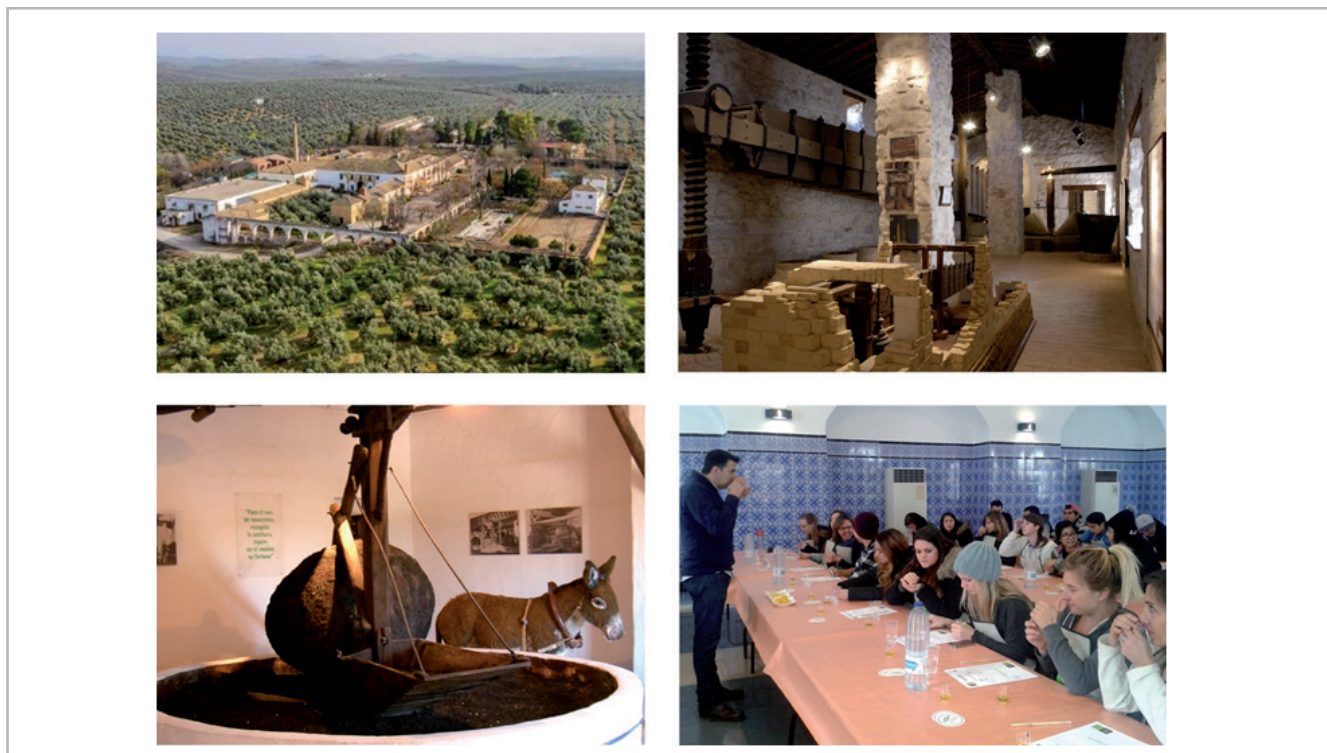
Figure 2.- Different elements of the museamization of olive oil mills: Figure 2A. Overhead view of the Museum of the Olive Oil Culture, Baeza (Jaén, Spain). Figure 2B. Interpretative area of historic olive oil mill in the same museum. Figure 2C. Interpretative museumization of stone olive oil mill with a donkey. Figure 2D. Interpretative taste of olive oil flavours by the visitors of museum.